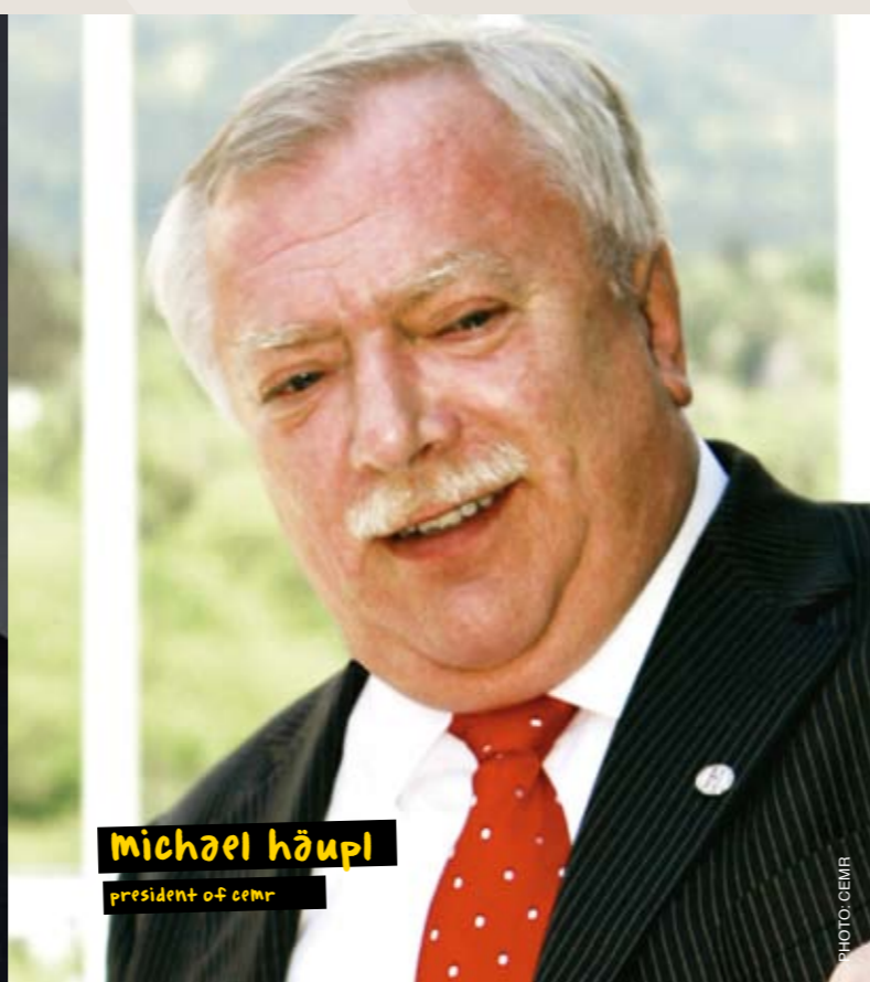
michael häupl president of cembr