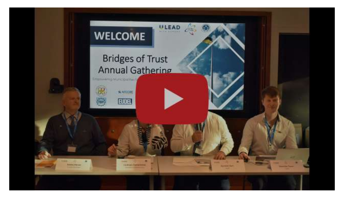
Highlight of our Annual Gathering of Bridges of Trust 2023 edition