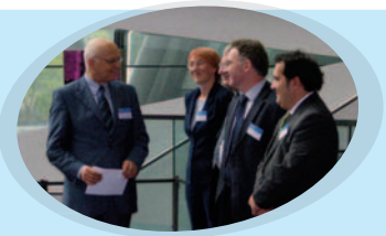
European Commissioner for the Environment, Stavros Dimas, with the representatives of the three nominees for the European Mobility Award 2005: Kromeriz (Czech Republic), Nantes (winner - France) and Donostia San Sebastian (Spain).

More information at: www.mobilityweek-europe.org