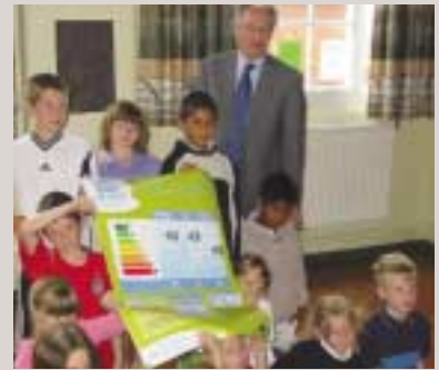
Children at the Wyvern School, in Dorset, England, hold up their energy usage certificate

One of the first steps local government can take to tackle climate change is to monitor and assess its energy usage. The Energie-Cités DISPLAY campaign helps local authorities and their municipal buildings calculate their energy usage. It also encourages them to display energy consumption data in a user friendly way in public buildings to help promote energy efficiency awareness. Over 850 public buildings are already involved.